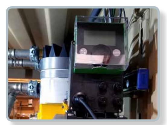
Chlorine Dosing Pump on MWPS-4000