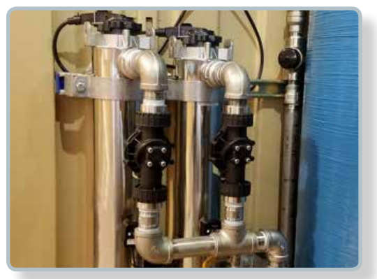
UV Lights on the MVVPS-4000